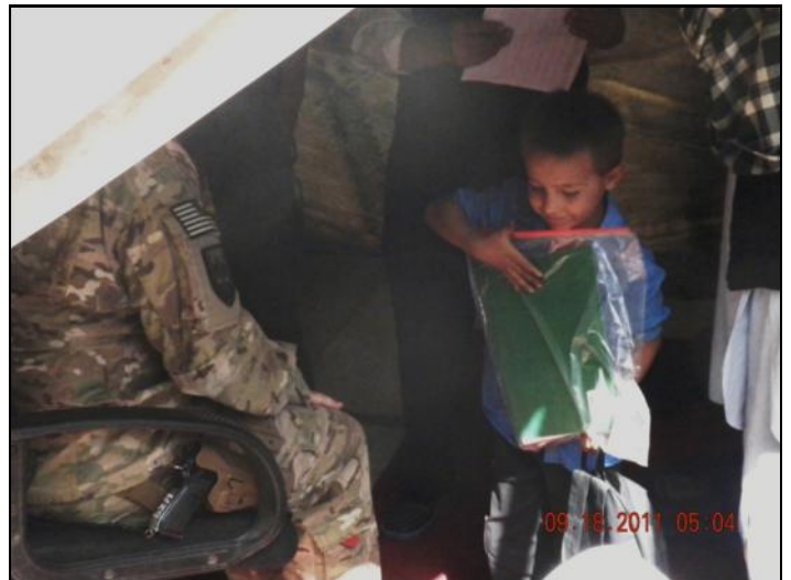
An Afghan child from the Amad Bahar School with his Operation Outreach school supply kit during a humanitarian assistance drop on Sept. 18, 2011.

The kids were very emotional and appreciative for everything we gave them.