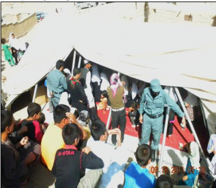
The local ANP Police Chief of Amad Bahar helping to distribute Operation Outreach school supply kits to the Amad Bahar school on Sept. 18, 2011.